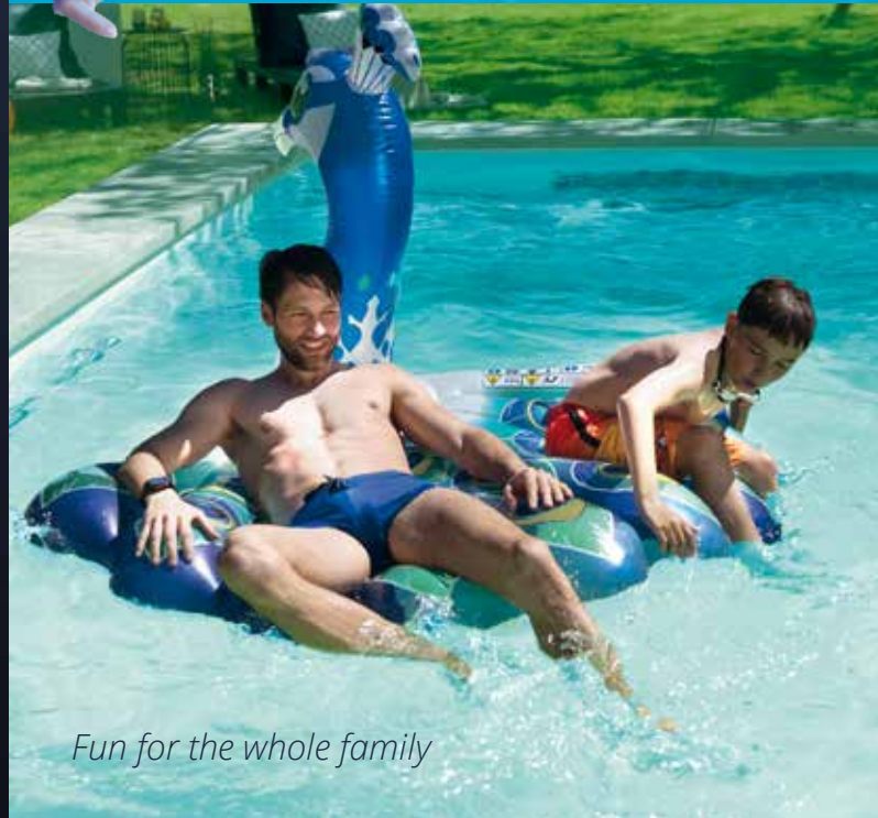
Fun for the whole family