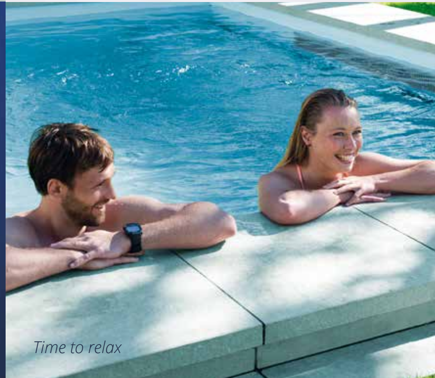
Time to relax

Stressful day? Head fit to burst? HydroStar takes your mind elsewhere. Work out while the current carries you — it's wellness for the soul.